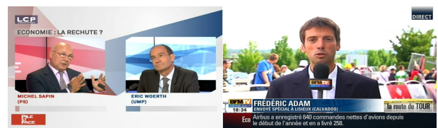
Figure 1: Two sample screen shots

ing the true speaker name for at least some of the clusters. A first system using automatic speech transcription (ASR) and manual rules for extracting speaker names from the transcription was proposed in [1]. An evolution of this approach using semantic classification trees (SCT) was presented in [2]. Both methods detect named entities in the ASR and use linguistic information to find the true name of a speaker. However, the frequent errors in the automatic transcription of proper names limit this approach. To prevent this issue, [3] combined subtitles and manual audio transcripts for face recognition in TV series. These sources of information can be found in TV series or movies, but generally not in news or talk shows. Automatic transcription of overlaid texts can provide names information with a high reliability (see figure 1). Indeed, TV broadcast news, reports or talk shows often use an overlaid text to introduce a person. In this paper, we address an unsupervised speaker identification method in videos with the help of overlaid texts obtained via video OCR. The core aspect of this approach is that no a priori speaker models are needed. Only speaker diarization and video OCR technologies are used.